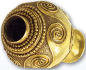
Part of the gold necklace MASAT

HIKING TRAILS they allow to know A guarda and its surroundings: PR-G160 Ruta da Desembocadura do Miño (Miño river Mouth Path) runs along the bank of the river and part of the Atlantic coastal, this route continues along the sealine by the Senda Litoral (Littoral Pathway), from O Muíño beach until the fishing port. And towards north going on the coastline connects with the Cetareas Route . Santa Trega Mountain has the PR-G122 Camiños do Trega (Footpaths of Trega). The Blue Path links the beaches distinguished with the Blue Flag, Area Grande & O Muíño, by a 5.6 kilometres tour.